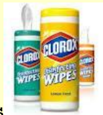
Lysol or Clorox Wipes

Thank you for donating extra supplies last week!!!